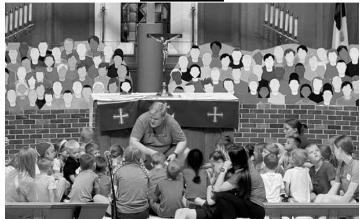
Pastor teaches the Bible Lesson