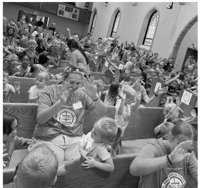
Youth sing The Creed.